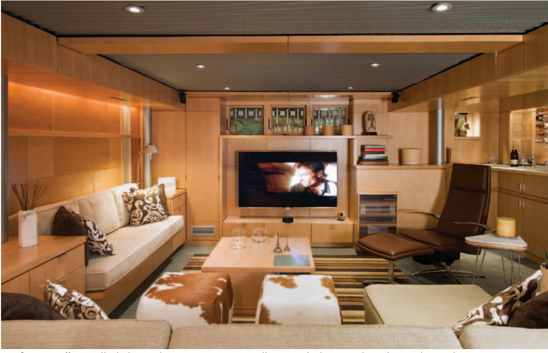
Sit for a spell. Installed above the entertainment wall, stained-glass windows by Andersen bring daylight into the space while screening the at-grade outdoor view. This lessens the impression of being in a room that is below grade. The entertainment zone houses a 60-in. flat-screen television in its own niche, audiovisual components located behind a Plexiglas door, and storage for DVDs and CDs. The home's computer server and additional storage are located behind a large L-shaped door. Conroy's custom coffee table and built-in bench enhance the modern but cozy feel of this portion of the room.

www.finehomebuilding.com FEBRUARY/MARCH 2012