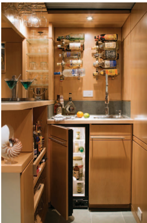
Home-time happy hour. Tucked into a corner, this wet bar has plenty of storage for glasses and bottles within easy reach of the bartender. The undersink cabinet and refrigerator doors are faced with maple-veneer panels to continue the sleek, clean look of the space. The bar top is angled to guide the eye out of the corner and toward the main sitting area. Set into the wall opposite the stairway, a display niche is another design trick used to draw the eye into the room. With its mirrored back, the niche gives the illusion of another window, helping to lessen the feeling of being below ground level.